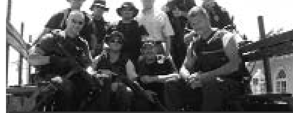
CMU Team assisting with recovery efforts in St. Bernard.