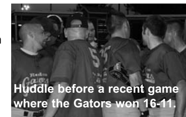
Huddle before a recent game where the Gators won 16-11.

Gators *Games are played at the Houma Airbase Field in the evening.