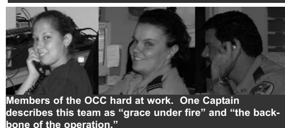
Members of the OCC hard at work. One Captain describes this team as "grace under fire" and "the backbone of the operation."